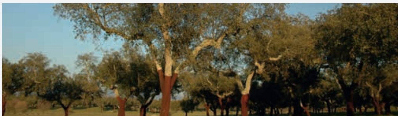
Mediterranean ecosystems and cork justify Portugal's involvement in the Mediterranean Basin.