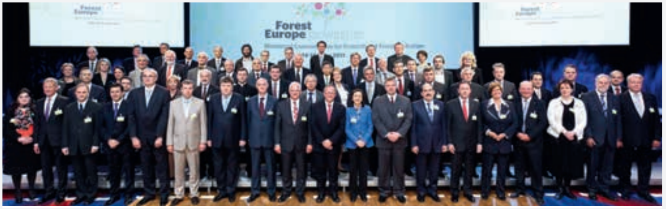
The Ministerial Conference in Oslo, June 2011.